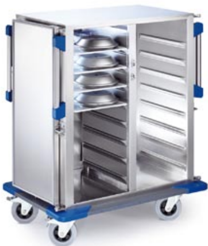
TTW-F 16-105 DSZG Ergonomical and compact with the BLANCO INMOTION design.

Gentle temperature regulation exactly to the degree from +30 °C to +75 °C.