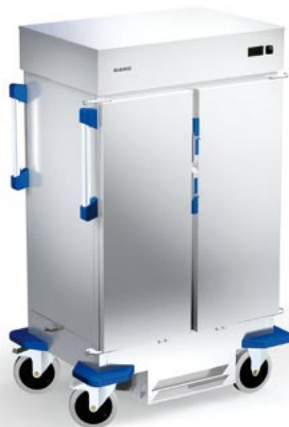
TTW-FK 16-115 DSZE TTW with convection cooling and all advantages of the ergonomic BLANCO INMOTION design.